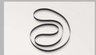
Rubber drive belt