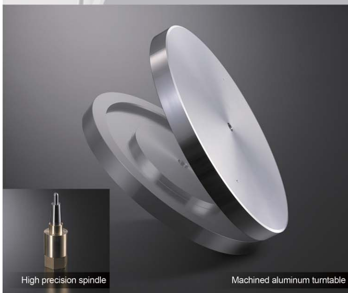
High precision spindle