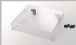
Dust cover OPPD-DSC151 Specific to the PD-151, 4mm thick acrylic, cam support hinges

Accessories (available as service parts)