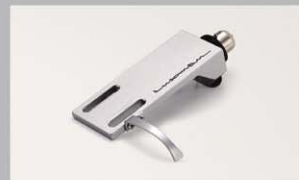
Headshell OPPD-SH1 Light magnesium alloy, 13g (including wires)