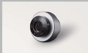
Heavy counterbalance weight OPPD-HW1 For cartridges of 9 to 19g (22 to 32g including headshell)