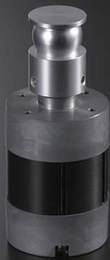
Brushless DC motor

The purity of musical pitch depends entirely on the stability of platter rotation. That's why LUXMAN engineers went to extraordinary lengths. We start with our unique sine wave/Pulse Width Modulation power supply, which provides ultra-stable direct current to our proprietary DC brushless motor. The result of years of development, this high-torque motor incorporates low-noise acoustic bearings and an optimized number of coil turns. The drive system monitors and maintains speed with our Proportional-Integral-Derivative (PID) feedback control loop. Proportional means quick achievement of target speed. Integral means fast correction of minor errors. And differential means control over rapid fluctuations. For added precision, the motor drives the outside flange of the platter through an uncommonly wide belt.