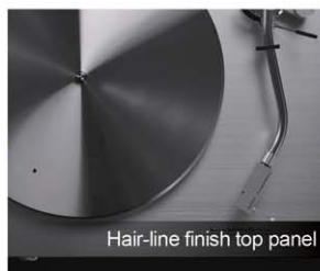
Hair-line finish top panel