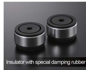
Insulator with special damping rubber

A player this massive requires specially engineered feet. We created large insulators from rubber carefully selected for superb damping across all operating temperatures. Each insulator offers 8 mm of independent height adjustment.