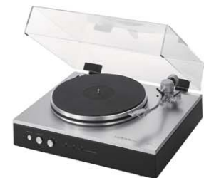
Dust cover (sold separately)

*Dust cover is sold separately as an optional extra.